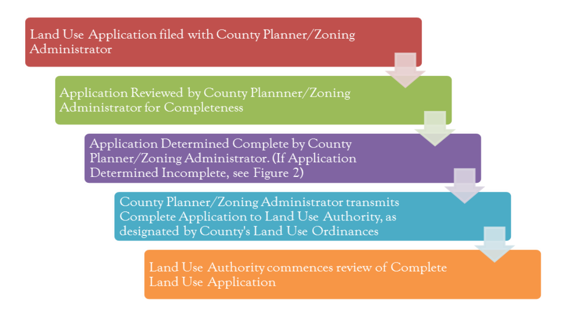
Figure 2 PROCEDURES FOR DETERMINATION OF LAND USE APPLICATION COMPLETENESS BY COUNTY PLANNER/ZONING ADMINISTRATOR